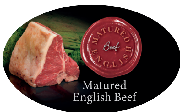
Matured English Beef

Our range of Weddel Matured beef is celebrating its 10th birthday this year. Weddel Swift developed this product in 2013 for our customers who were in the market for a superior and consistent quality Matured English Beef.